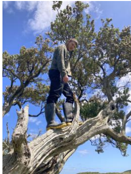
Chatham Island Ake Ake