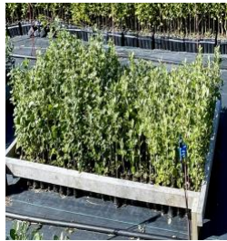
Chatham Island Ake Ake

Whether you want to purchase a single plant as a memento or your trip to the island or perhaps a mixed box of Chatham Island Natives, see our summer specials below. (prices are inclusive of GST)